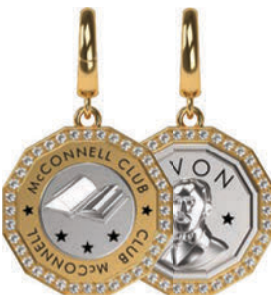
DAVID H. MCCONNELL CLUB

Gold and silver plating with the Great Oak in celebration of our founder and the 4 A's representing Anytime, Anywhere, Always, Ask.