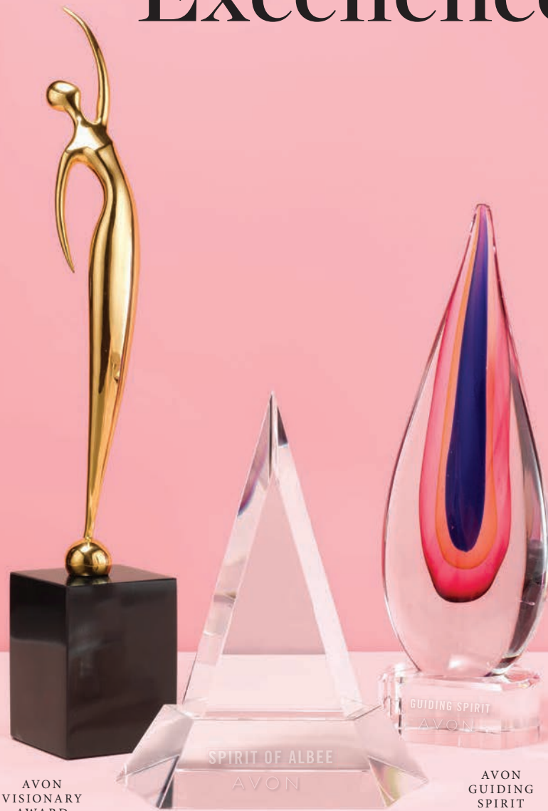
AVON VISIONARY AWARD