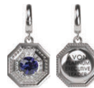
PLATINUM EXECUTIVE LEADER

Gold plated with a created emerald representing wealth and prosperity and the strength of sharing with others.