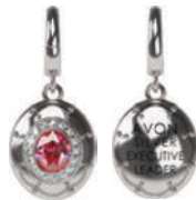
SILVER EXECUTIVE LEADER

Rose gold plated with a genuine amethyst, the color of royalty with a blend of blue (calm stability) and the fierce energy of red.