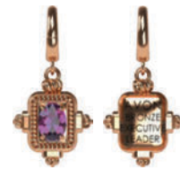
BRONZE EXECUTIVE LEADER

Gold plated with a genuine faceted citrine representing the sun and the fresh new beginnings you experience as you rise in achievement.