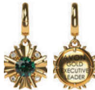
GOLD EXECUTIVE LEADER

Silver plated with a genuine garnet, the stone of prosperity and abundance encouraging gratitude and service to others.