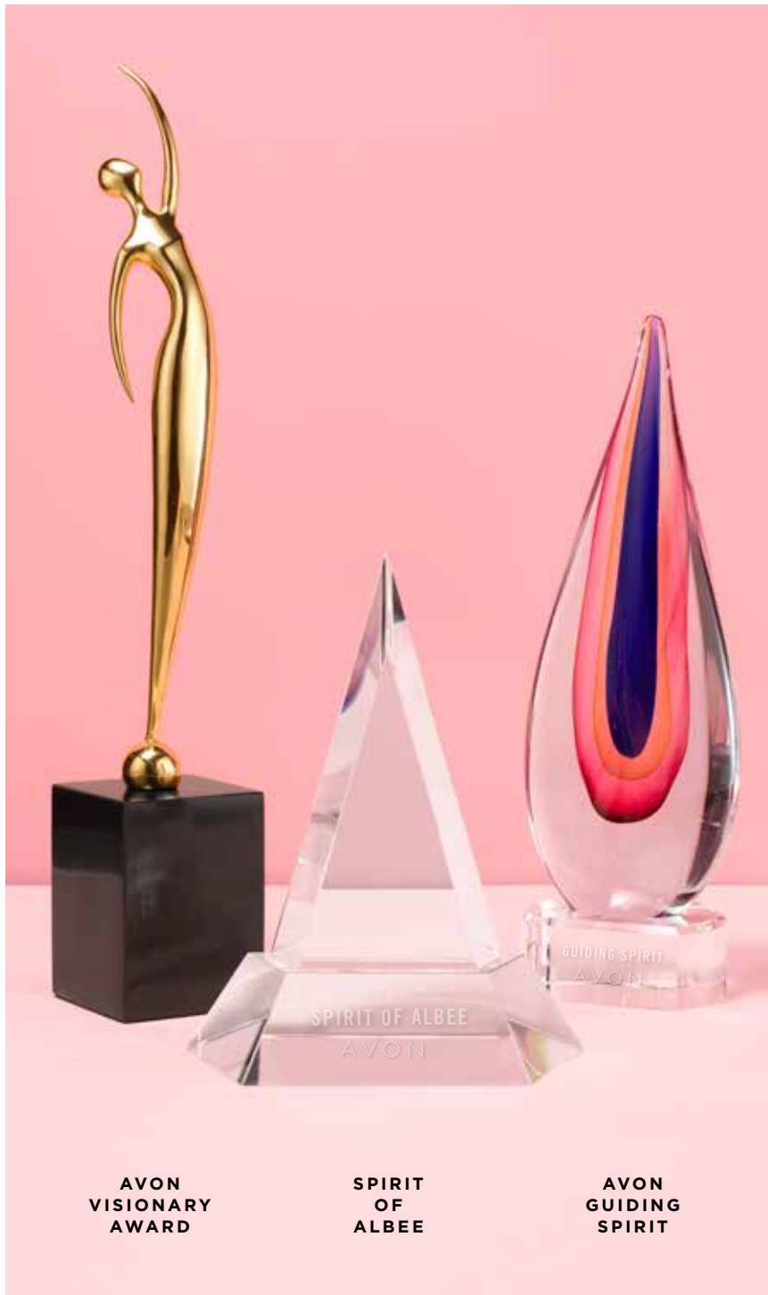
AVON VISIONARY AWARD